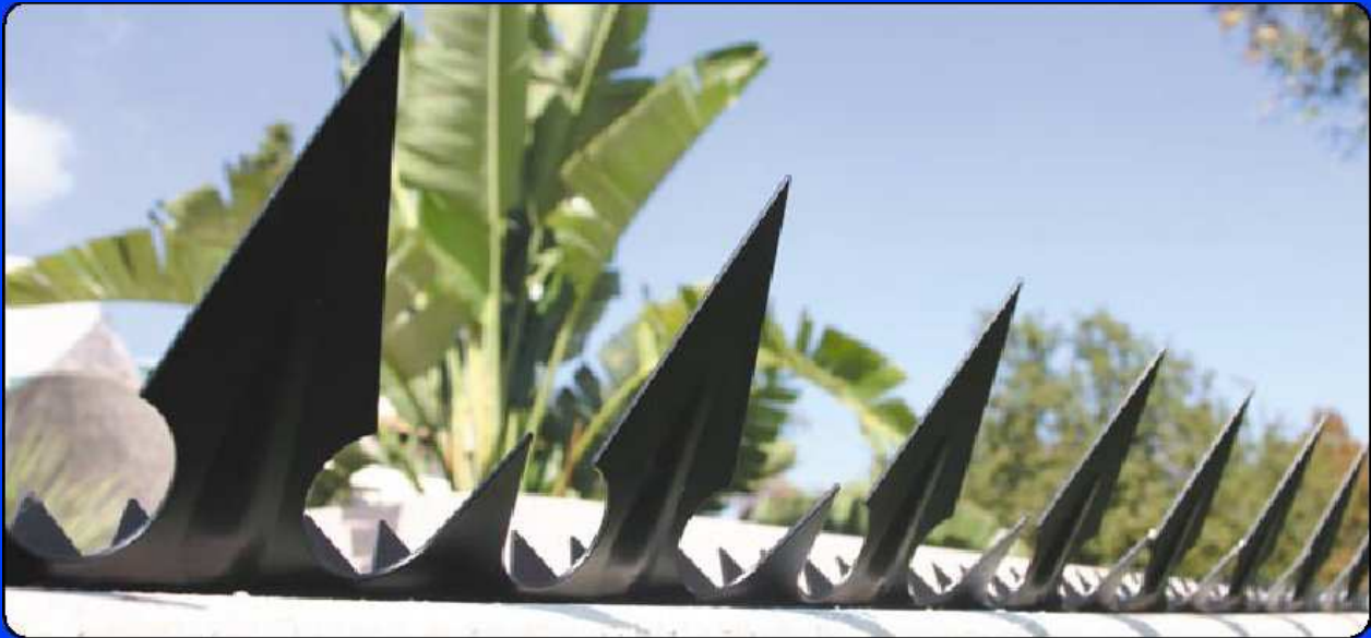
Double Row Reinforced Spike