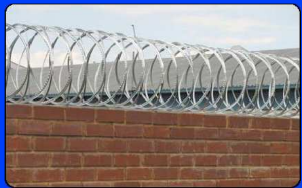
700mm diameter Tangle Coil