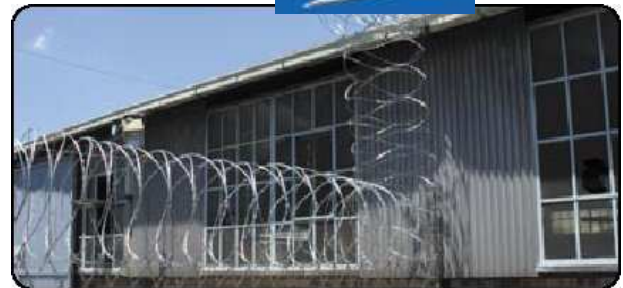
Isolate industrial & commercial premises