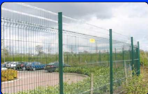
Welded Mesh with Ribbon Strip