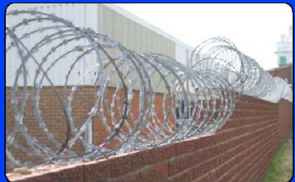
Ultra Barbed Coil