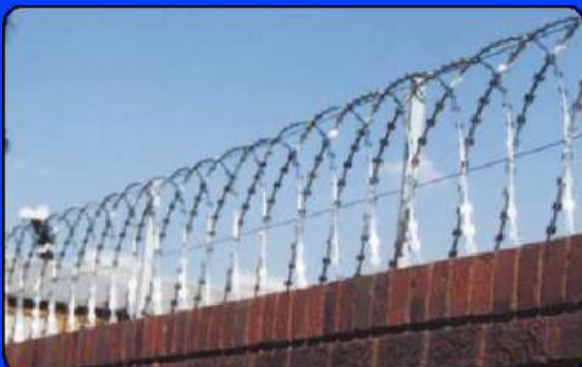
Ultra Barbed Flatwrap