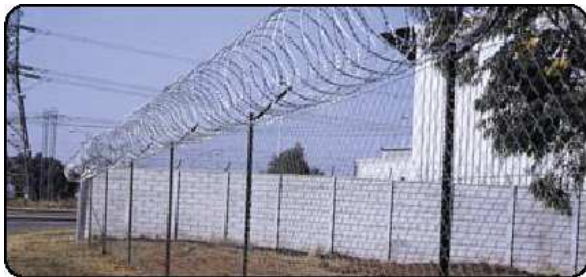
Existing fence topped with Concertina